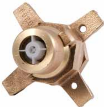
Expansion Connection with Check Valves