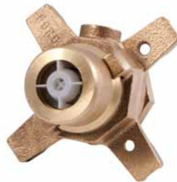
Locking Expansion Connection with Check Valves