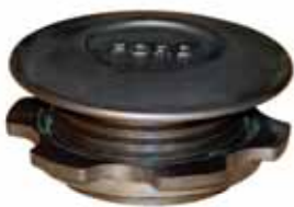
PTP Plug and Nut

For plugging an existing hole to keep debris from entering the pit, order the PTP (plug less the ERT bracket) or PTP-3-25 (plug with a longer shank).