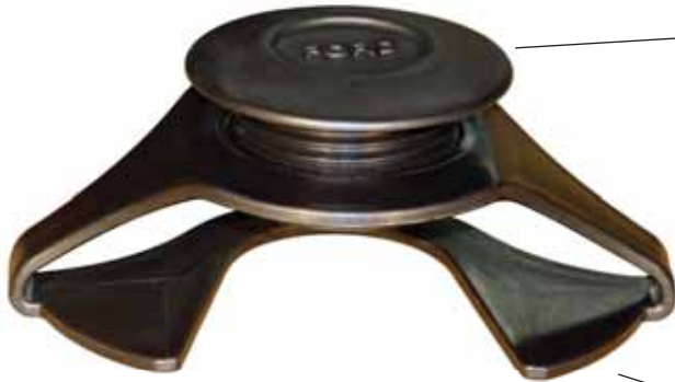
PTP-BR Plug and Universal ERT Bracket

The Universal ERT bracket attaches through a meter box lid with an existing 1-27/32" or 2" AMR hole. The Universal Bracket accommodates most automated meter reading devices and positions the ERT at the top of the meter pit allowing for optimum radio transmission.