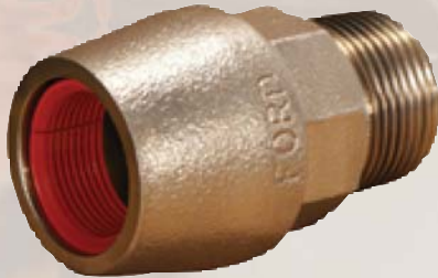
PET/CTS ULTRA-TITE (Red Gripper Ring)

Ford's Ultra-Tite compression fitting provides an immediate lock onto Polyethylene Pipe (PEP/IPS) or Polyethylene Tubing (PET/CTS) when inserted to the internal stop. This simple stab fitting is available beginning March 2010, on the following 3/4" and 1" couplings: